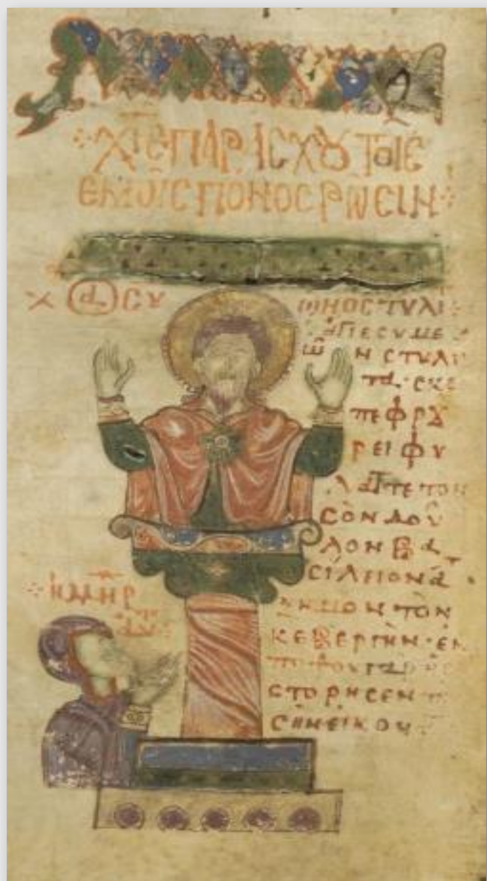
Chicago - University Library, Joseph Regenstein Library 947, f. 151v